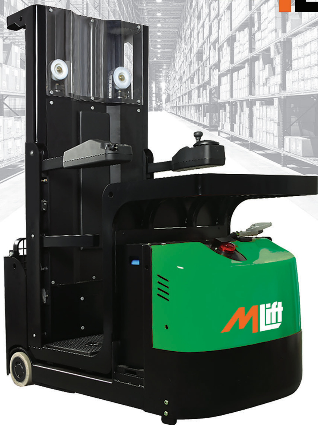
OPB5E Medium Level Order Picker 0.5t